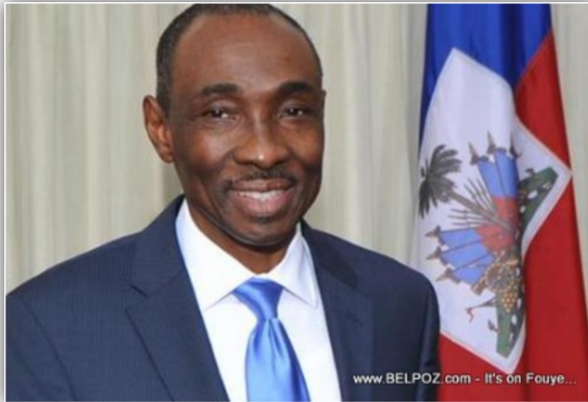
His Excellency Prime Minister Evans Paul, Haiti